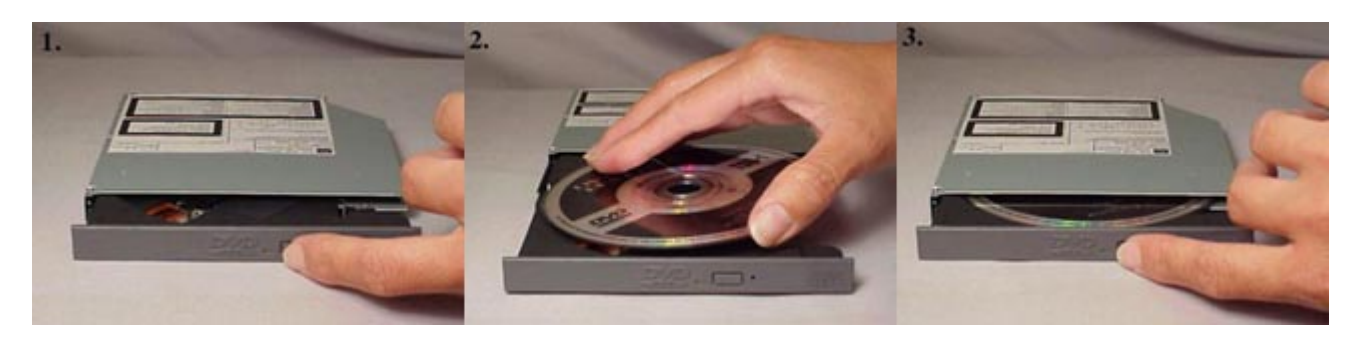
Figure 1.Inserting Disc

To insert a DVD in a DVD-ROM drive that is mounted horizontally, perform the following steps: