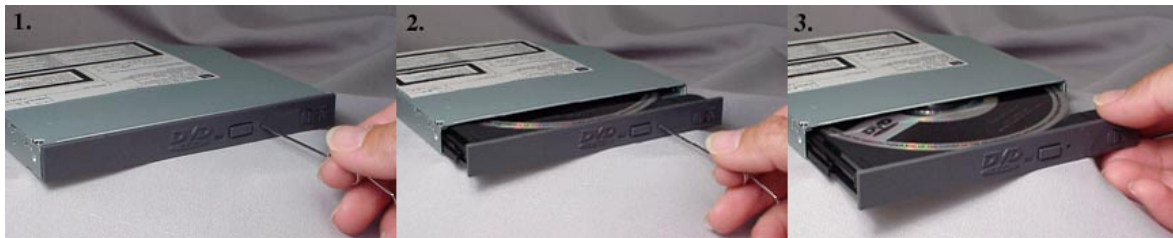
Figure 2.Using Emergency Eject