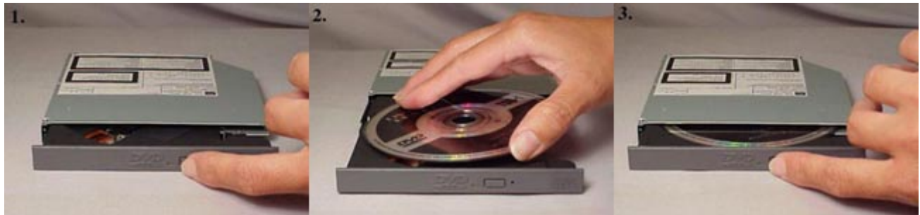
Figure 1. Inserting Disc

To insert a DVD in a DVD-ROM drive that is mounted horizontally, perform the following steps: